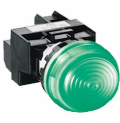
PILOT LAMP YW series