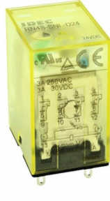
RELAYS RN series