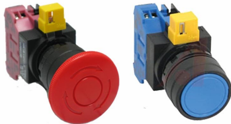
PUSHBUTTON HW2B series

The IDEC Group, together with customers, will choose the best solution yo your need, we will davcllop and provide the progressive products, systems, and solutions to create the future of automation beyond. A wide variety of control units and Relays for your automation beyond including : Flush Silhouette Control Units, Dual Pushbutton Switches, Jumbo Dome Pilot Lights, Emergency Stop Switches, Enabling Switches, Grip Switches, Slim Power Relay, Relay Sockets.