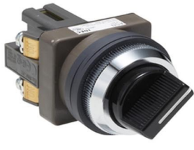
PUSHBUTTON ASN series