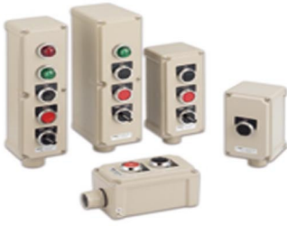
Control AGA series