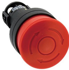
EMERGENCY STOP SWITCH HW1E series