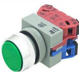
PUSHBUTTON ABW series