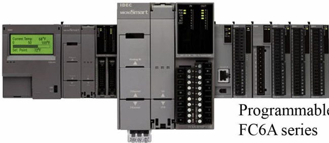
Programmable Logic Controller FC6A series