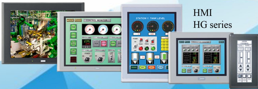
HMI HG series