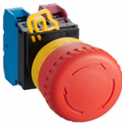
PUSHBUTTON YW series