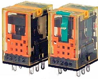
RELAYS RU series