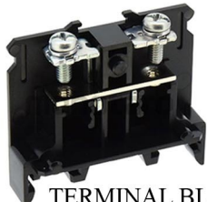
TERMINAL BLOCK BNH series